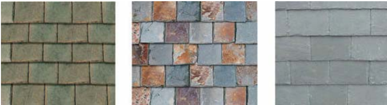
Figure 10-3 Natural Slate Tiles

Traditionally slate roofing tiles were hand cut and sized, but now manufacturers pre-cut the slate roofing tile with a machine to assure exact measurements. Nail holes are also pre-drilled and countersunk to speed construction and repair. Countersunk holes allow the roof tile to lie flat for longest possible lifetime. A stronger roof structure is needed to withstand the weight of slate roofing material; therefore many manufacturers require an architect's recommendation on each property prior to installation of natural slate roofs. There are other alternatives to natural slate which are considered below.