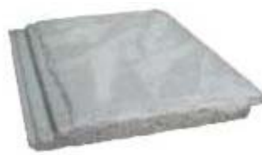
Concrete Flat "slate" Tile