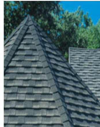
Figure 10-2 Laminated Shingles