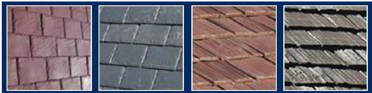
Figure 10-5 Rubber Shingles

These shingles are made from recycled automobile tires and can simulate the look of slate or wood shakes with relatively low weight. They are obviously hail resistant.